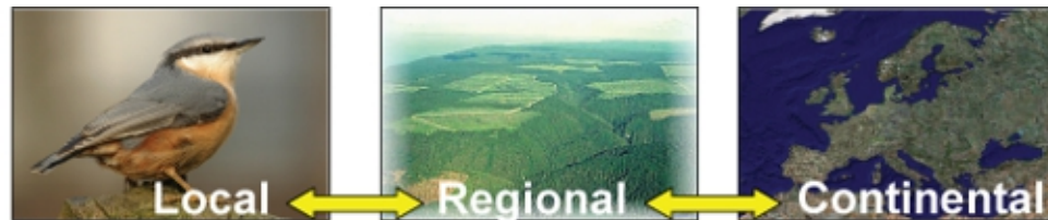
Fig. 1. The relation between species, habitats and earth observation data ( http://www.EBONE.wur.nl/UK/Project+Work+Packages/WP5+Inter-calibration/ , accessed March 16, 2010)

correspondence matrices. [...] And these correspondence matrices actually help us to identify how good the link is between the two.